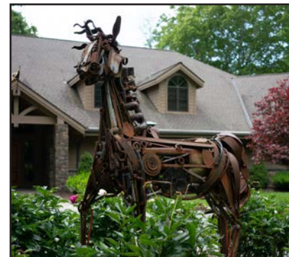
Site #11: (Appalachian House)* Jonathan Bowling (Greenville, NC) Trojan Exhaust , 2018 Repurposed steel