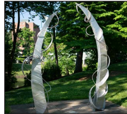
Site #9: Jordan Parah (Greenville, NC) Peaceful Passage , 2016 Aluminum