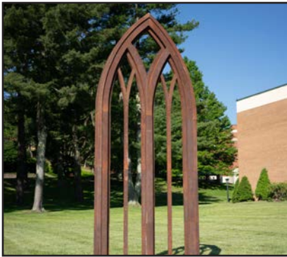
Site #1: Beau Lyday (Valdese, NC) Gothic Doorway , 2017 Wood, tin, steel