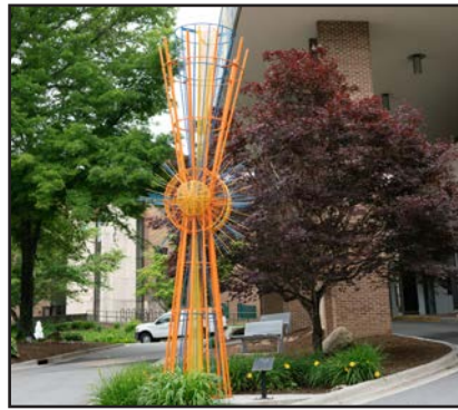
Site #4: Hanna Jubran (East Grimesland, NC) Neutron Star , 2018 Steel, paint