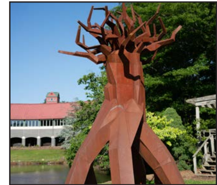
Site #10: Rick Herzog (Athens, GA) "It's all about electricity," 2013 Steel