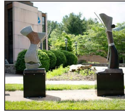
Site #7: Shawn Morin (Bowling Green, OH) Column A, Column B, Column You, Column Me , 2018 Granite, marble, steel, stainless steel