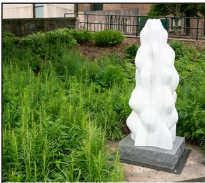
Site #5: Susan Moffatt (Chapel Hill, NC) Succulent II , 2016 Marble, granite on steel base