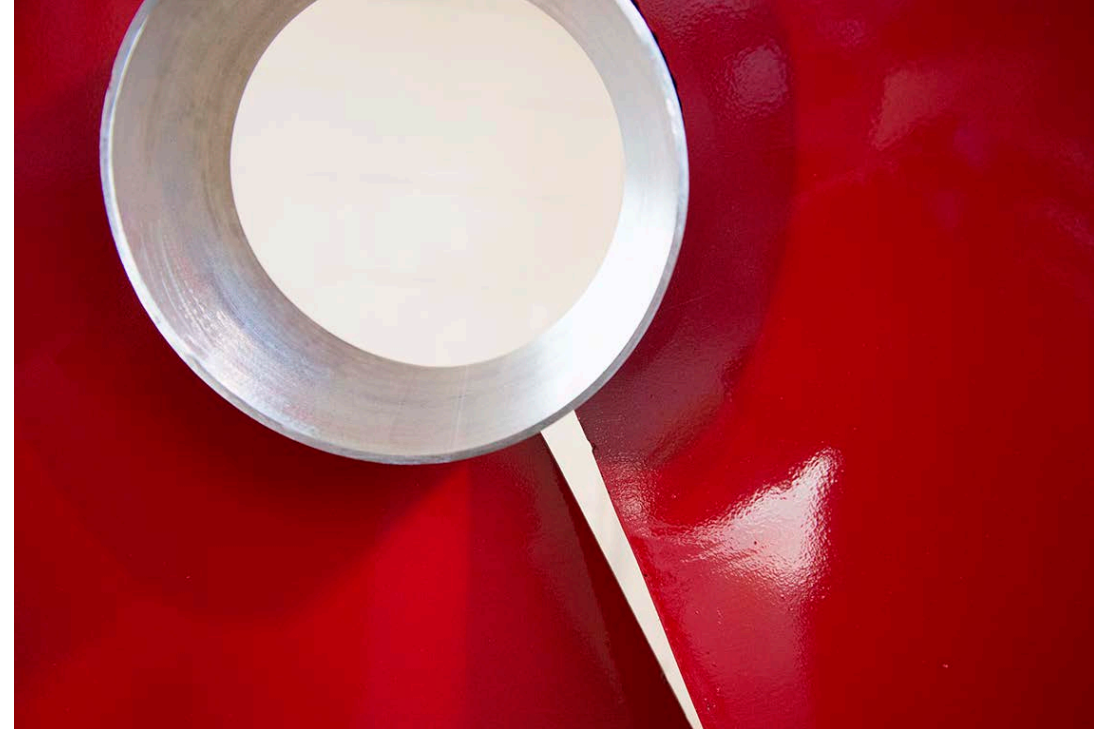
Brian Glaze, Connection