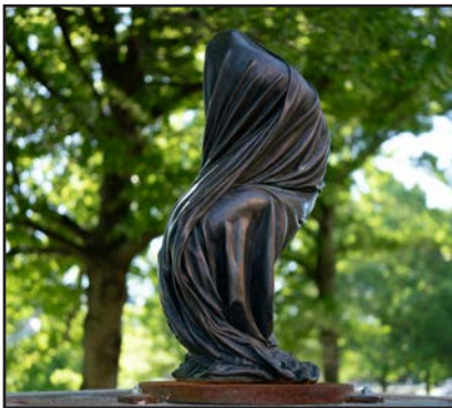
Site #3: Jacob Burmood (Ottawa, KS) Draped Fabrication , 2017 Bronze on steel base