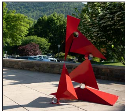
Site #6: Brian Glaze (Sinking Spring, PA) Connection , 2017 Painted steel