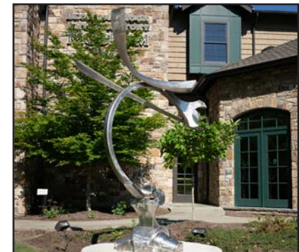
Site #12 (BRAHM)* Andrew Light (Lexington, KY) Anomie Exquisite , 2014 Stainless steel